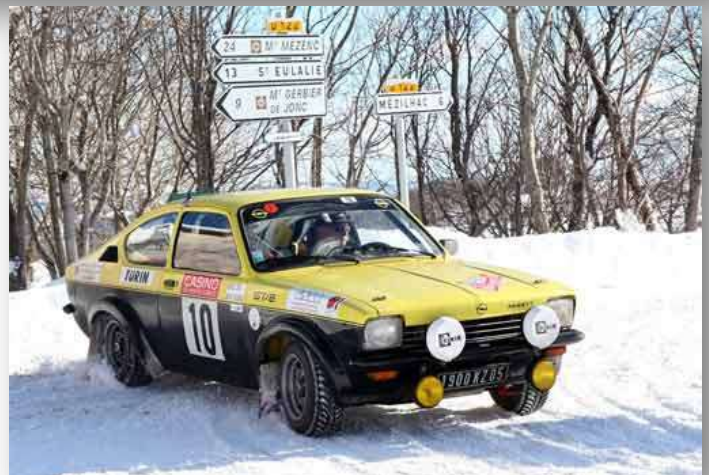
2nd O/A Durand/Chol - 1977 Opel Kadett GT/E